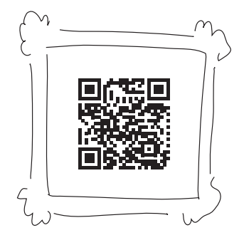
Scan to view all our festive menus

Beetroot hummus, lemon & parsley hummus, toasted sourdough, white chicory, celery, figs, Baby Gem lettuce, radishes (2301 Kcal) £28.00